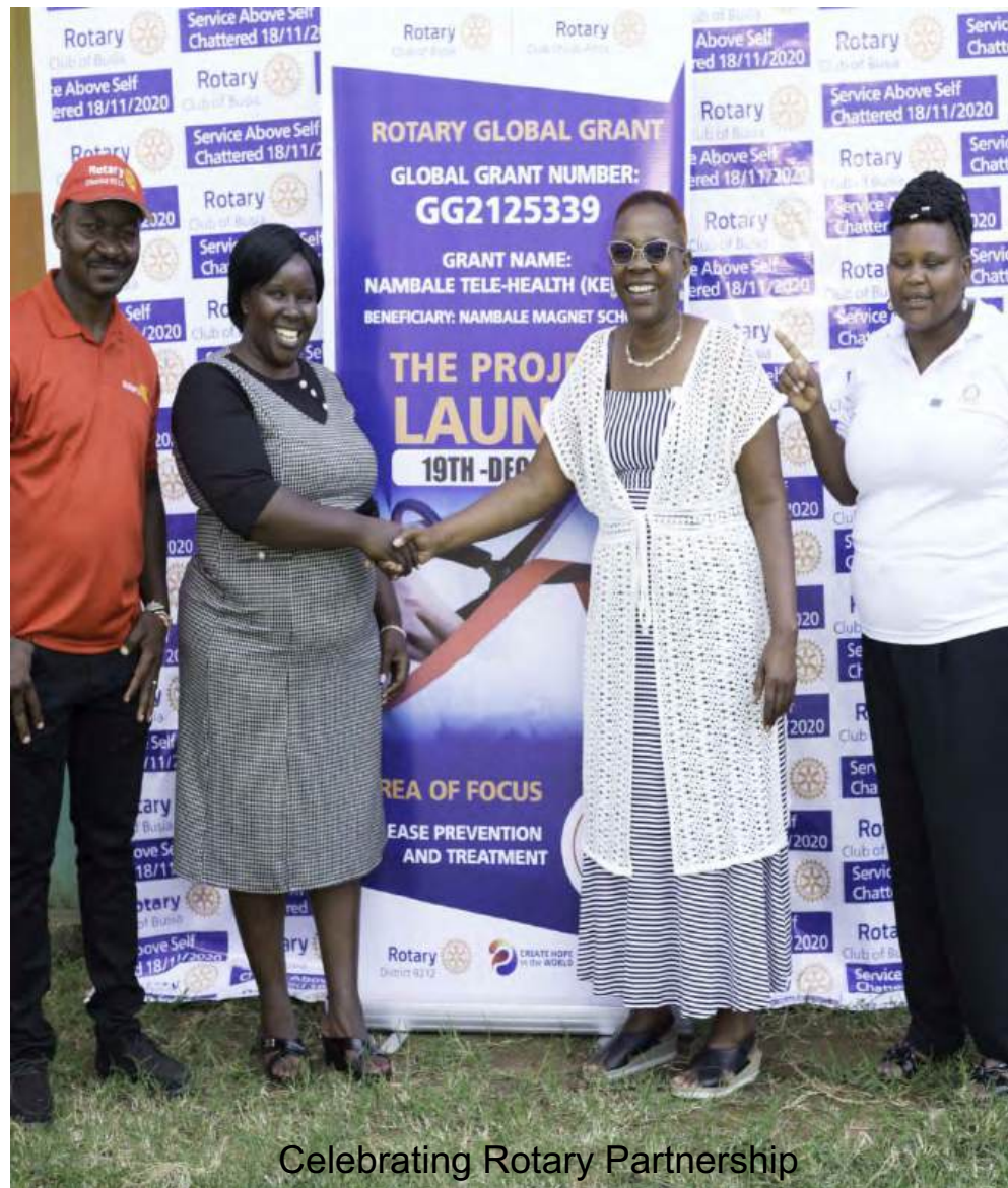
Celebrating Rotary Partnership