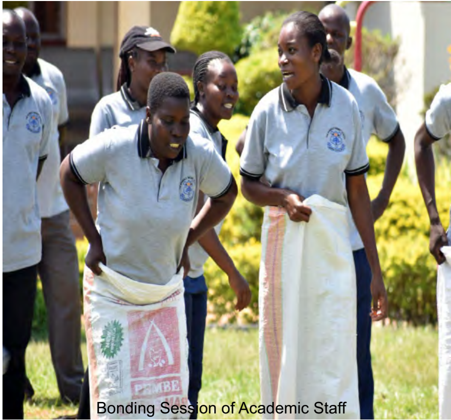
Bonding Session of Academic Staff