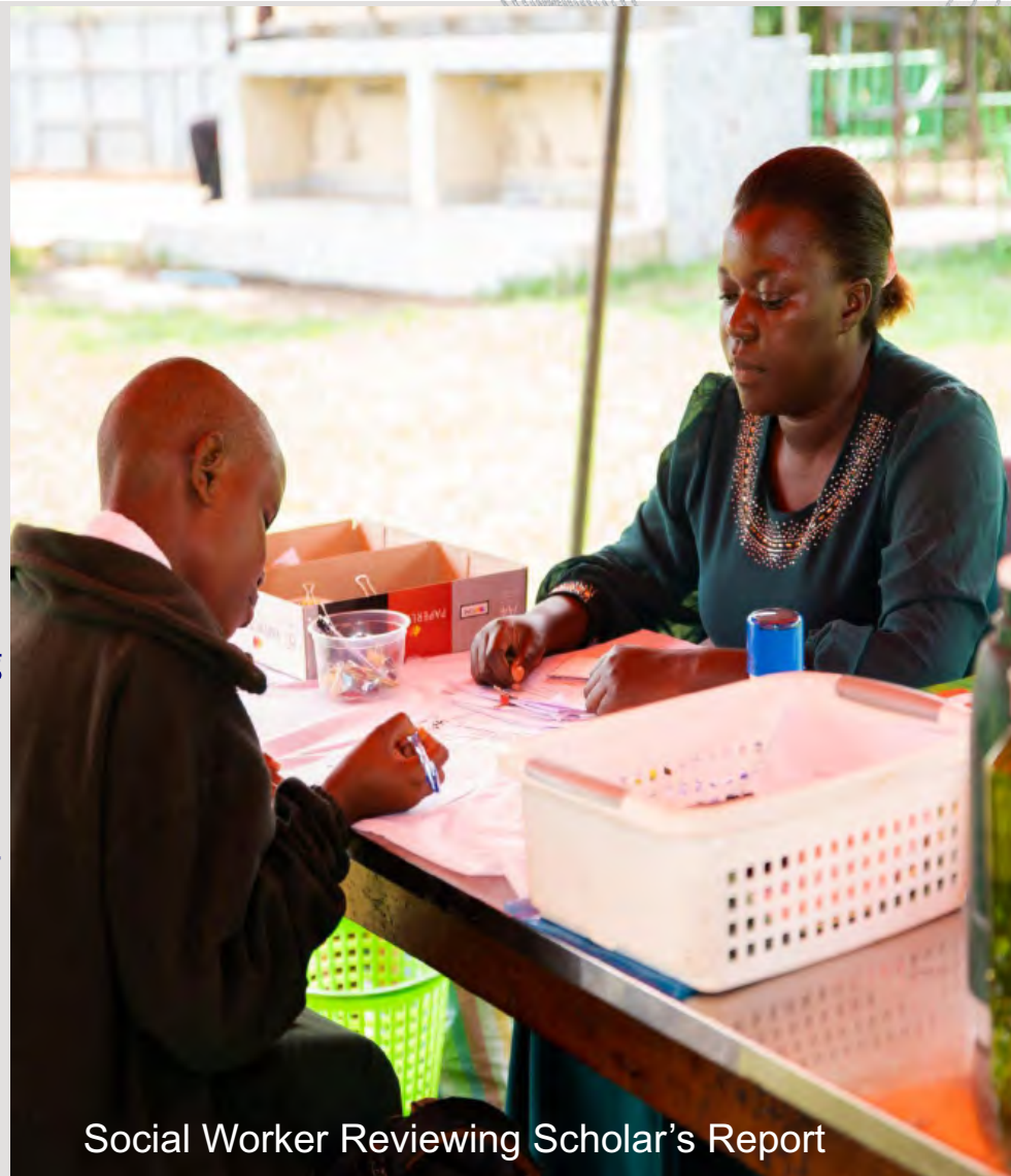
Social Worker Reviewing Scholar's Report