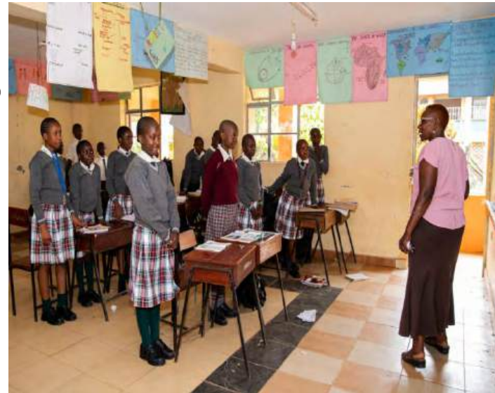
Director Consulting with Scholar's